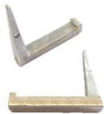
Crampon to associate

They allow the fixing of flat conductors 30 mm wide on masonry walls made of concrete or bricks by stamping into polyamide dowels.