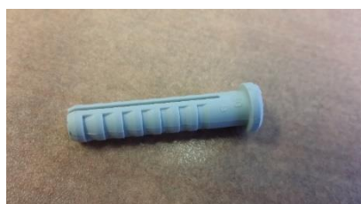
Example of installation